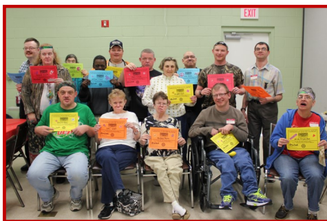
2013 Advisory Board Meeting